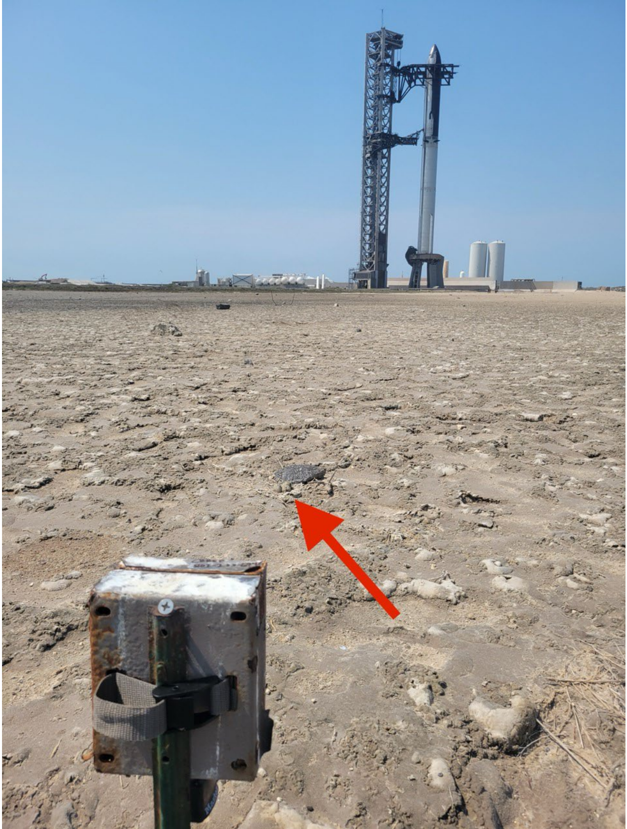
Figure 13. WIPL 1 as referenced by red arrow with game camera installed nearby facing north pre-launch on June 5, 2024.