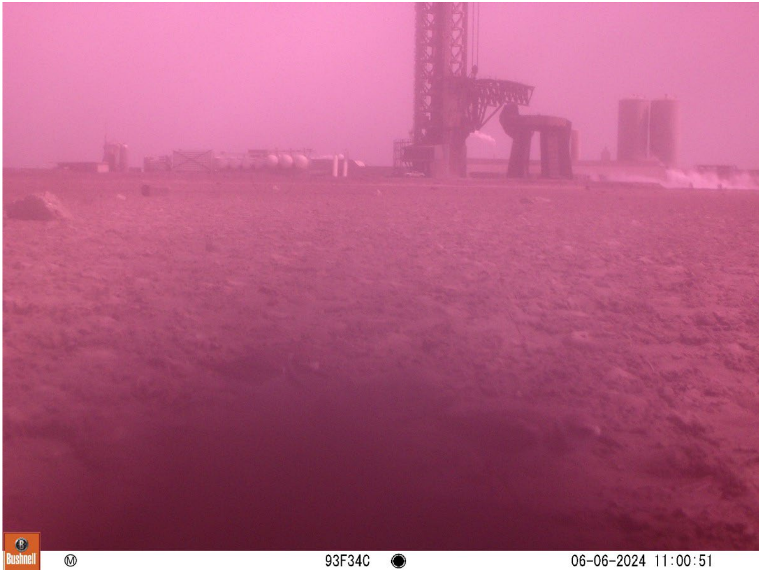
Figure 19. WIPL 1 game camera showing both WIPL adults in attendance but nest cup not quite visible due to pebble lodged in camera lens and overall pinkish hue post-launch on June 6, 2024.