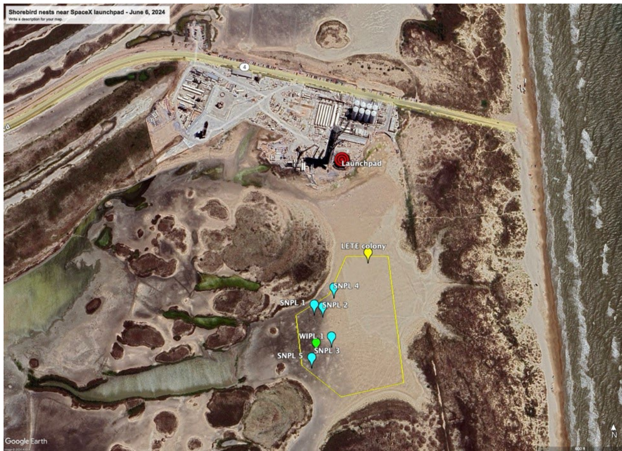
Figure 1. Map of the South Launch subsite at Boca Chica showing the locations of active plover nests and a dispersed Least Tern colony on June 5, 2024 in relation to the rocket launchpad.