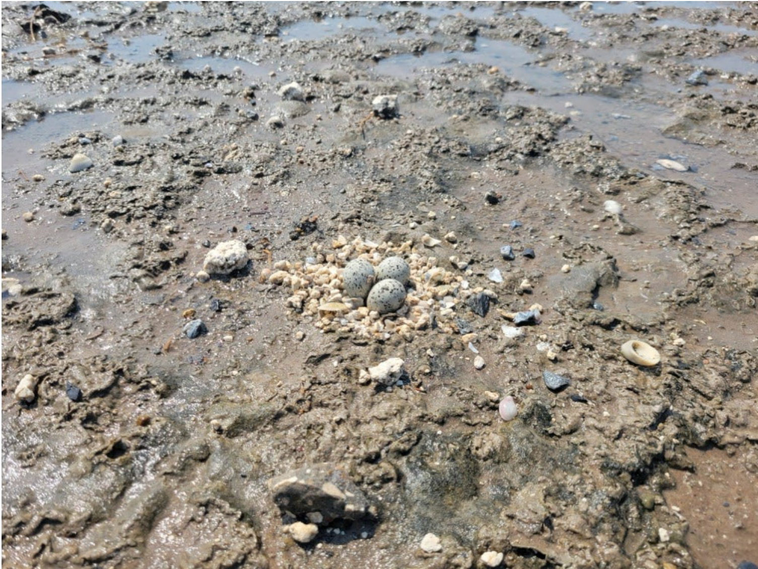
Figure 2. SNPL 1 nest intact and with 3 eggs on June 5, the day before the rocket test launch.