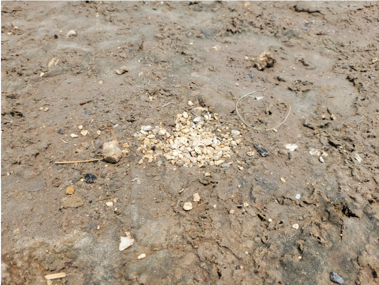
Figure 3. SNPL 1 nest with 0 eggs and no signs of predator tracks despite moist ground that would be highly impressionable by any predators on June 6, 2024.