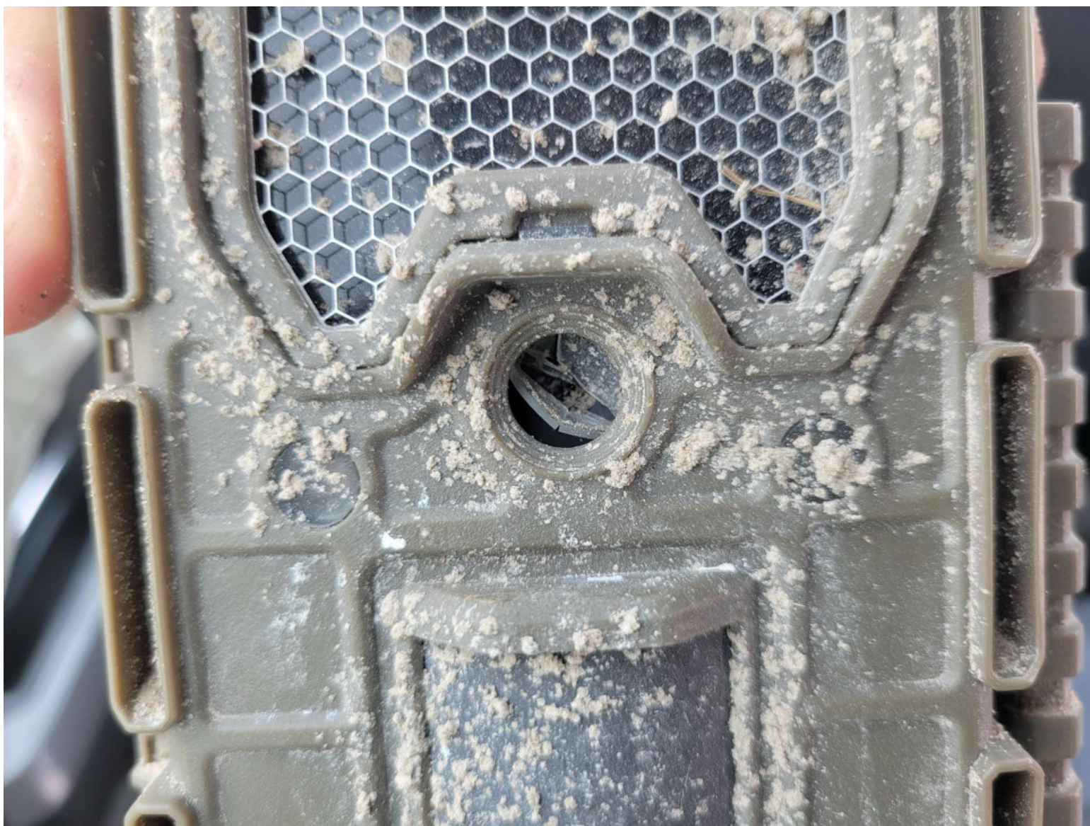
Figure 15. Game camera from WIPL 1 showing completely cracked camera lens after pebble was removed post-launch on June 6, 2024.