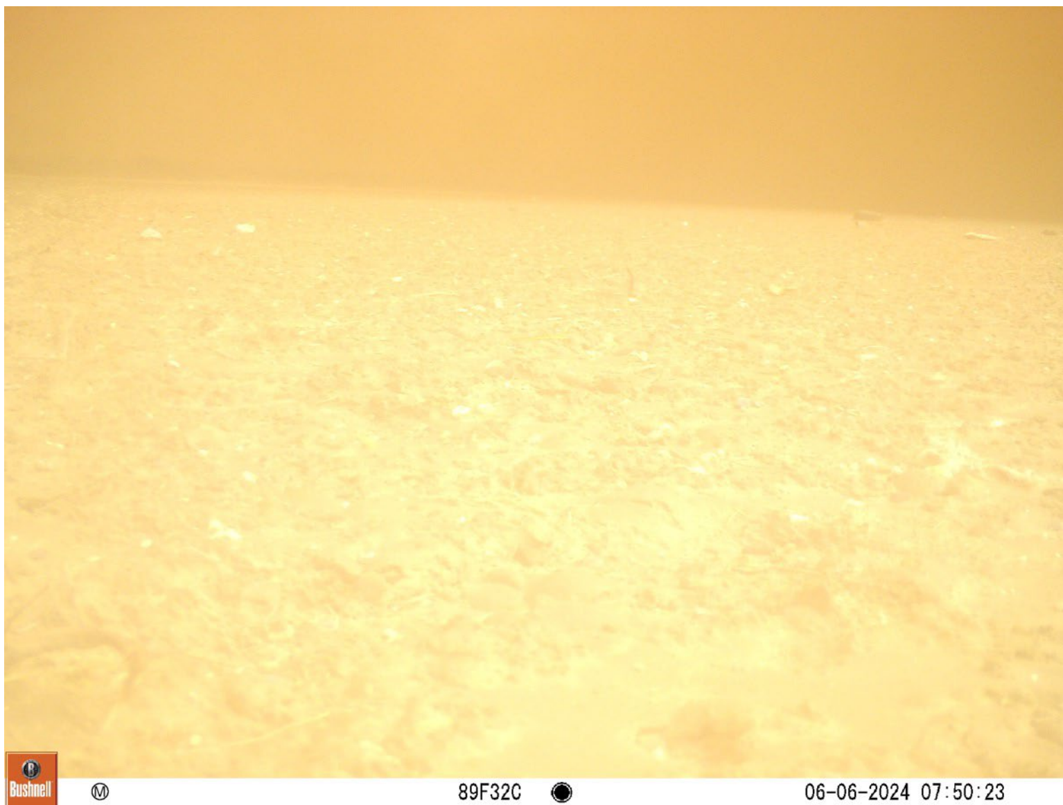
Figure 23. The last SNPL 2 game camera photograph taken post-launch until CBBEP staff checked the nest 4.5 hours later on June 6, 2024.