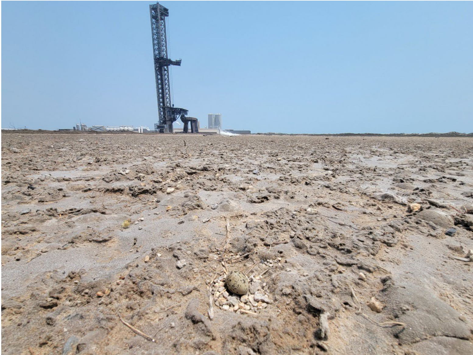
Figure 4. SNPL 2 nest with only one egg remaining and the rocket launchpad in the background on June 6, 2024.