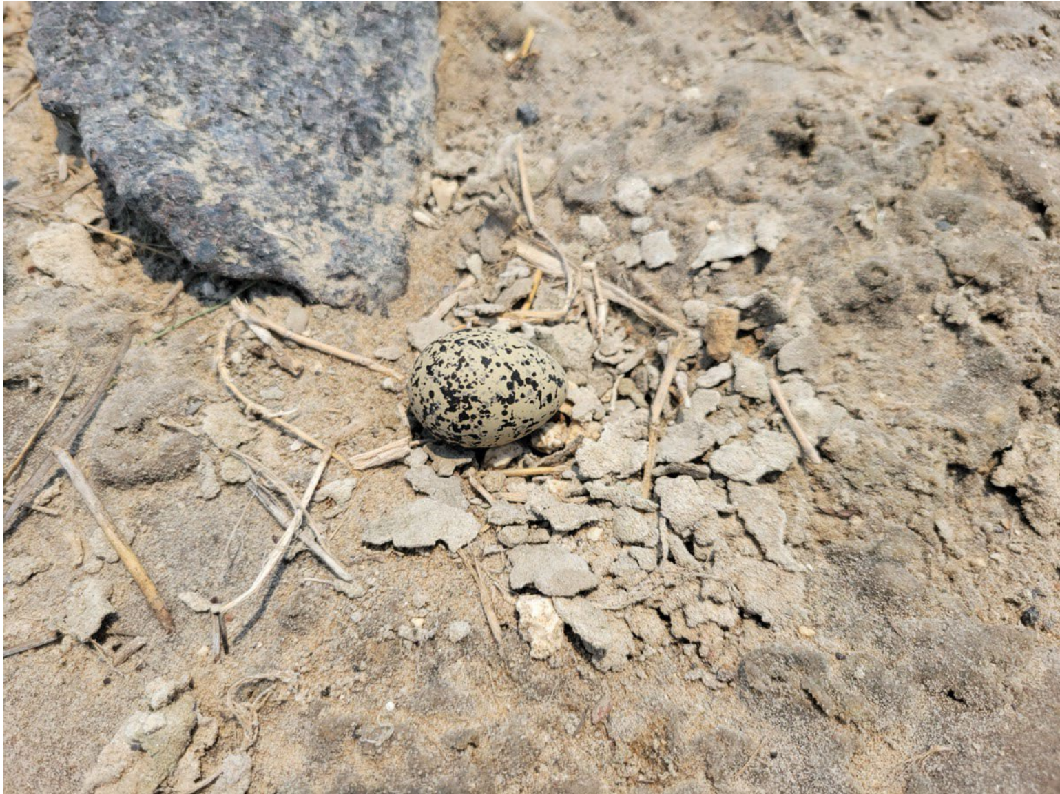
Figure 6. WIPL 1 with only a single intact egg remaining on June 6, 2024.