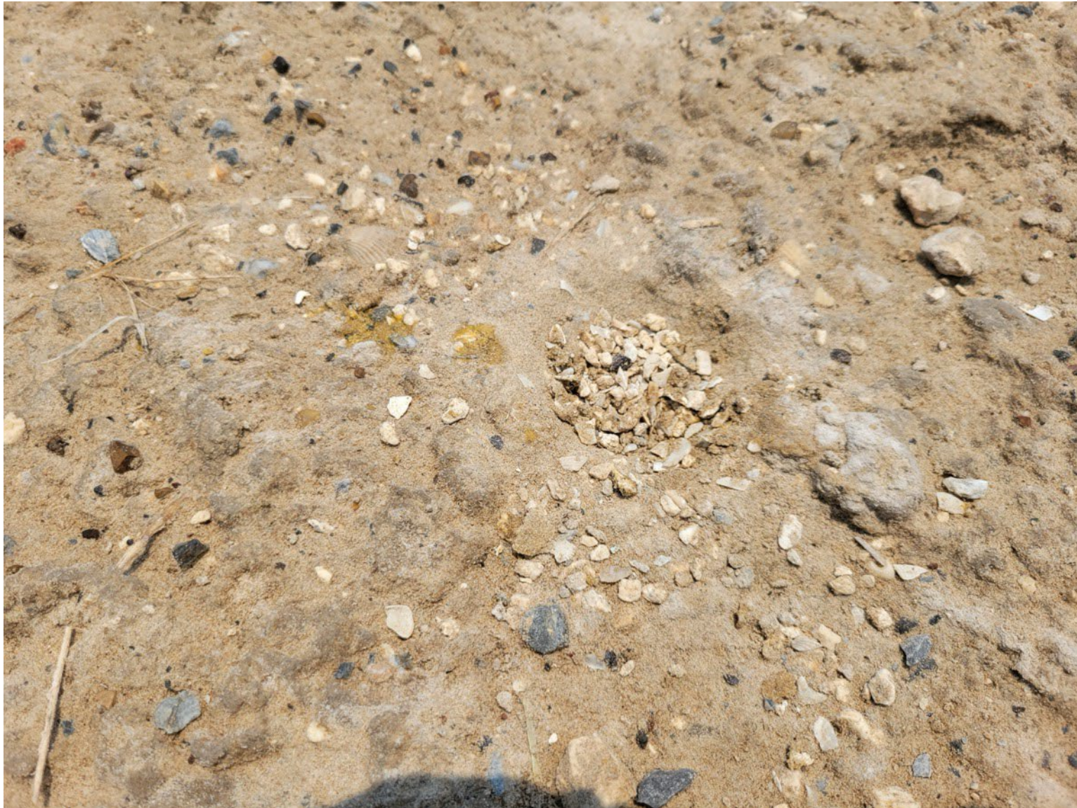
Figure 9. SNPL 4 with dried egg contents spilled in the nest cup and droplets moving away from it in a straight line on June 6, 2024.