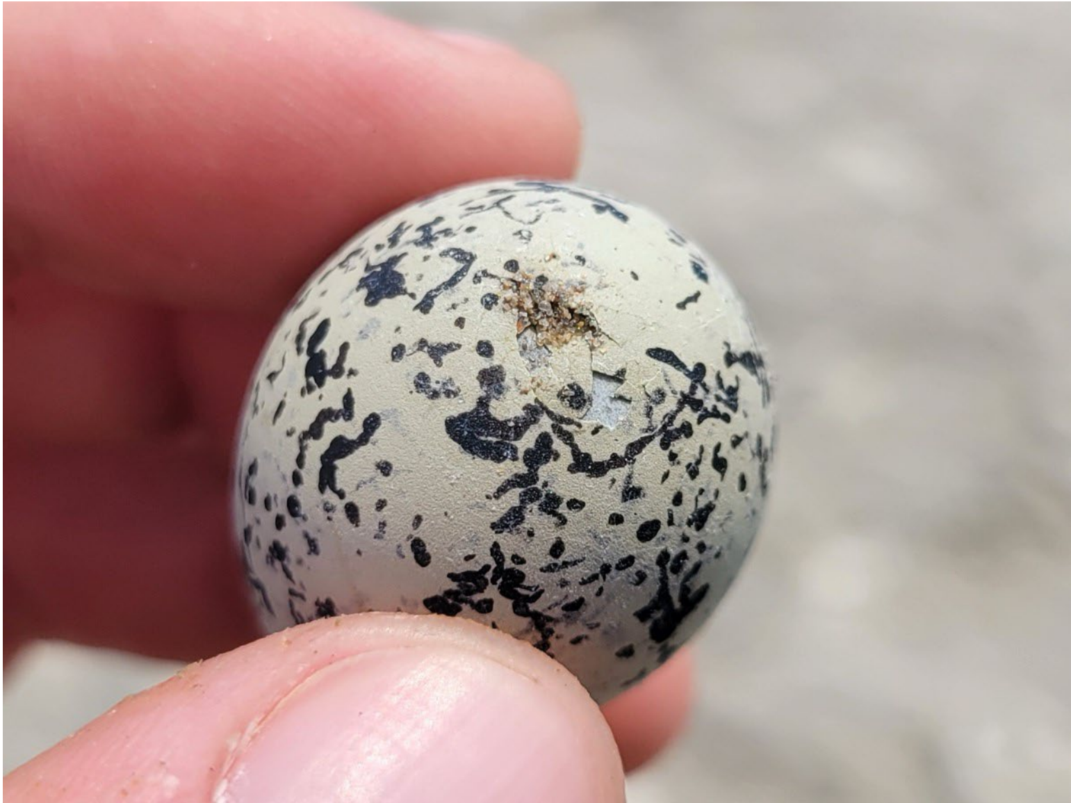
Figure 8. Lone egg from SNPL 3 with large cracks in it on June 6, 2024.