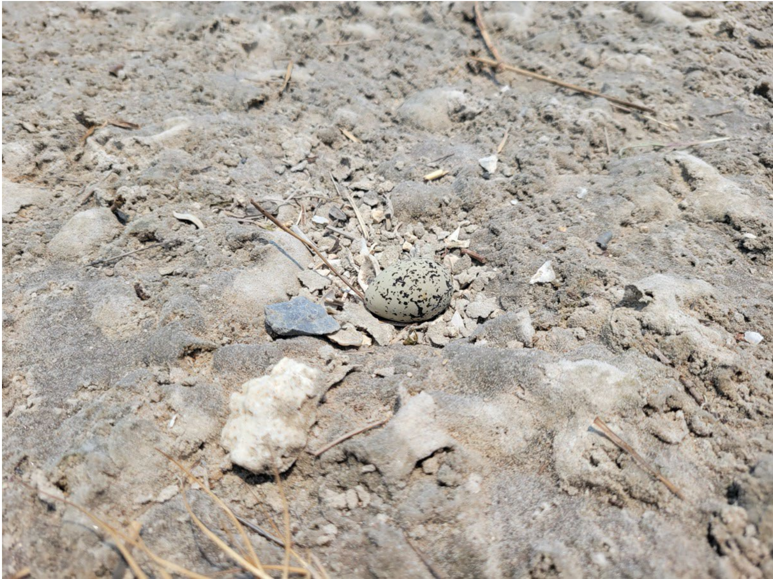
Figure 7. SNPL 3 with only a single egg remaining on June 6, 2024.