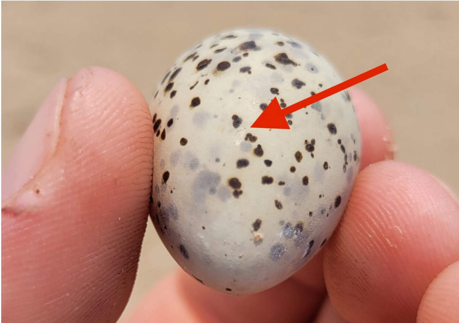
Figure 11. Small but noticeable crack on egg from LETE 2 on June 6, 2024.