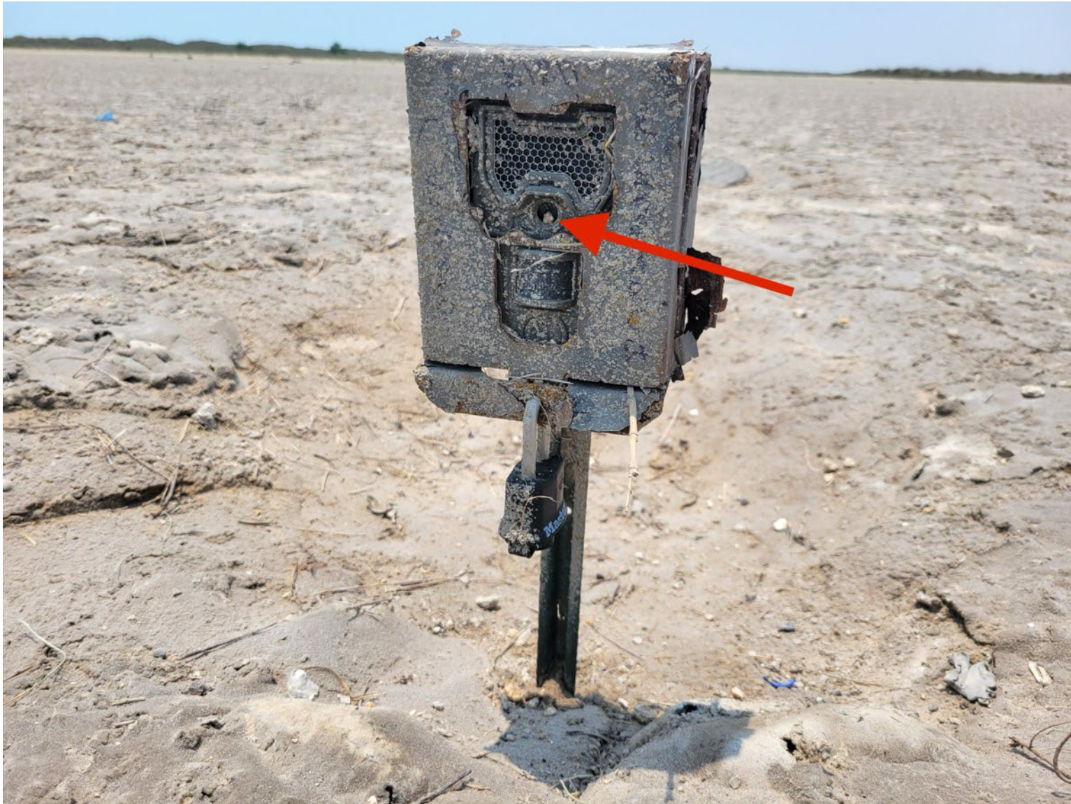
Figure 14. Game camera from WIPL 1 showing the launchpad-facing side covered in mud as well as a concrete pebble sitting in front of the camera lens post-launch on June 6, 2024.