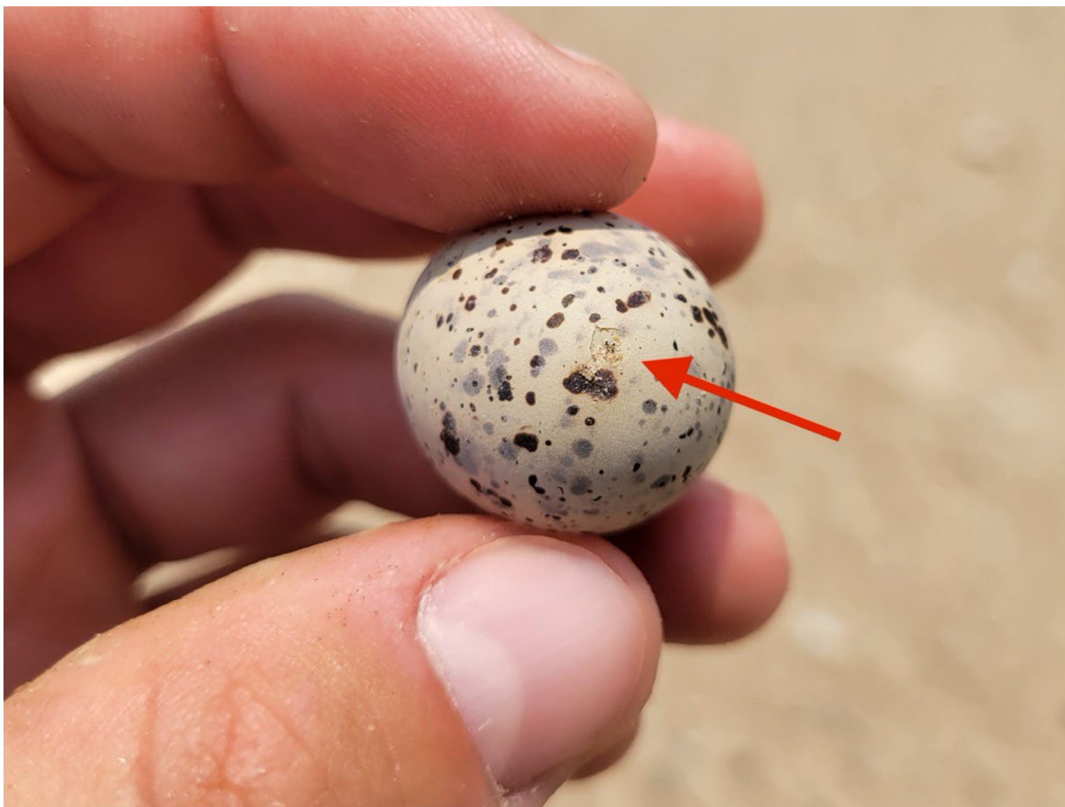
Figure 10. Lone egg from SNPL 5 with a small but significant depressed crack on June 6, 2024.