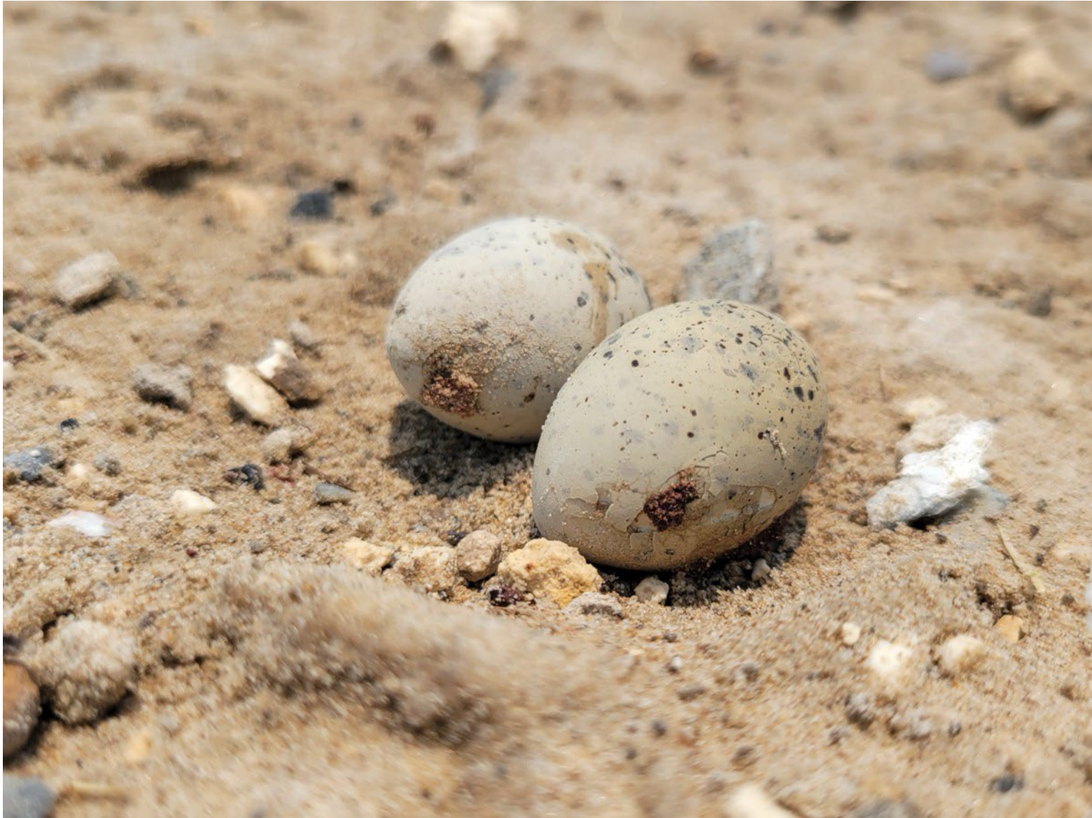
Figure 9. LETE 1 showing both eggs with large holes/cracks and dried egg contents emerging on June 6, 2024.