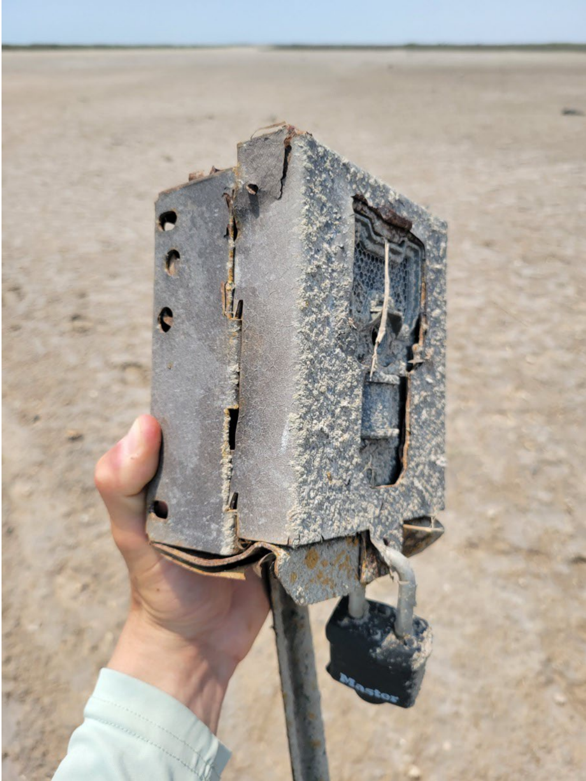
Figure 20. Game camera from SNPL 2 showing the launchpad-facing side completely covered in mud as compared to a clean side post-launch on June 6, 2024.