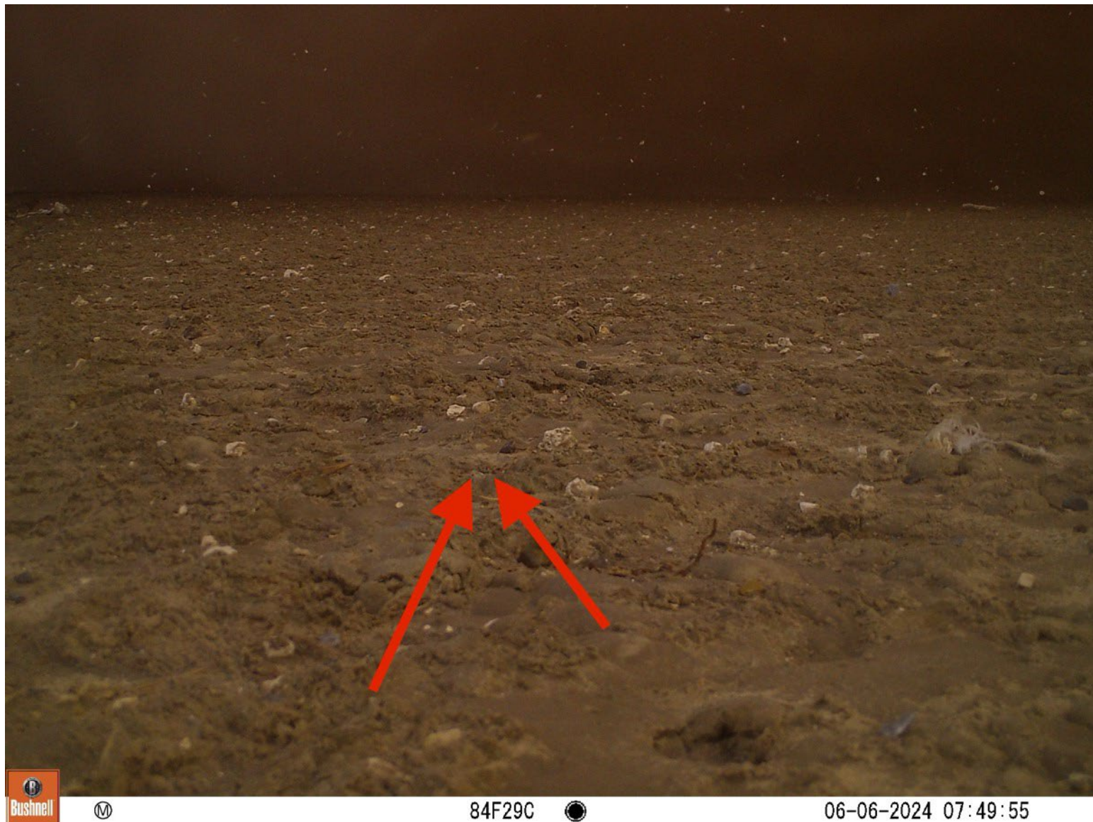
Figure 22. SNPL 2 game camera showing dust cloud and small pale-colored debris moving toward nest and game camera at a high rate of speed, with nest cup and at least two eggs possibly visible as referenced by red arrows on June 6, 2024.