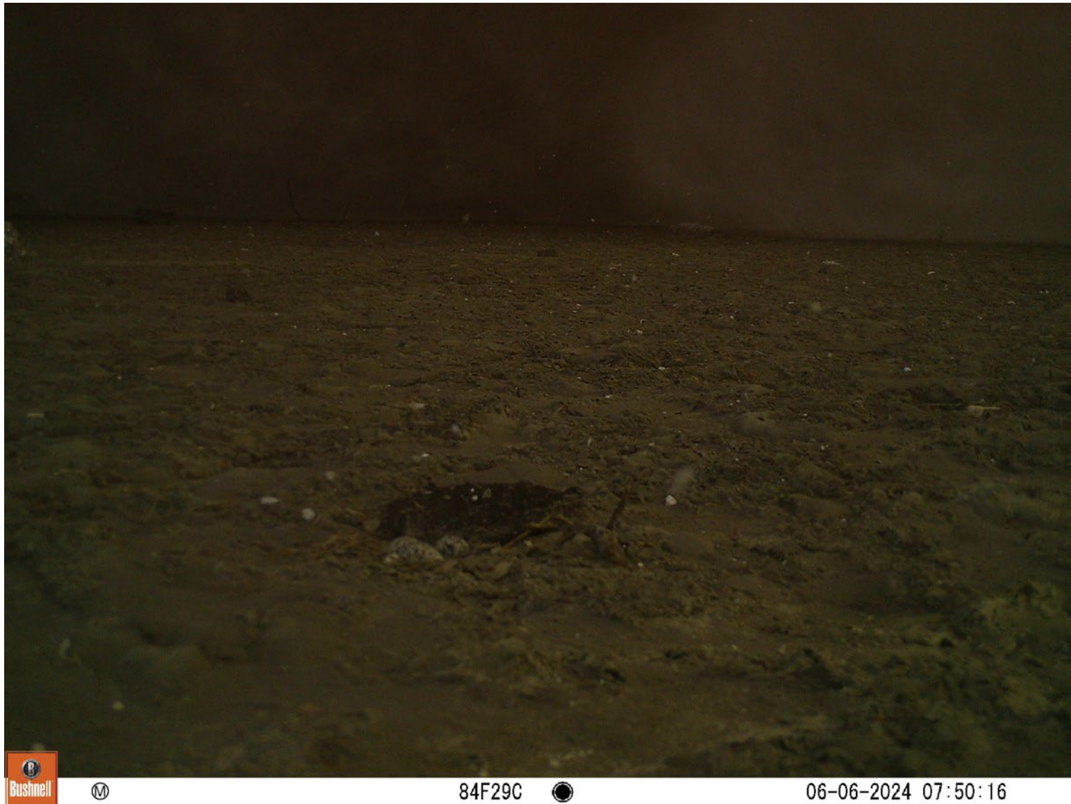
Figure 18. WIPL 1 game camera showing dust/smoke and small pale-colored debris moving toward the nest and camera at a high rate of speed during the rocket test flight launch on June 6, 2024.