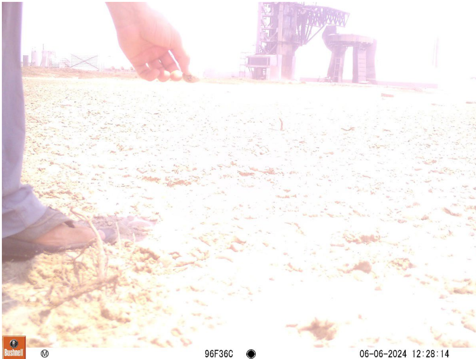
Figure 24. SNPL 2 game camera with CBBEP staff checking SNPL 2 nest post-launch on June 6, 2024, proving camera is still operational despite limited clarity.