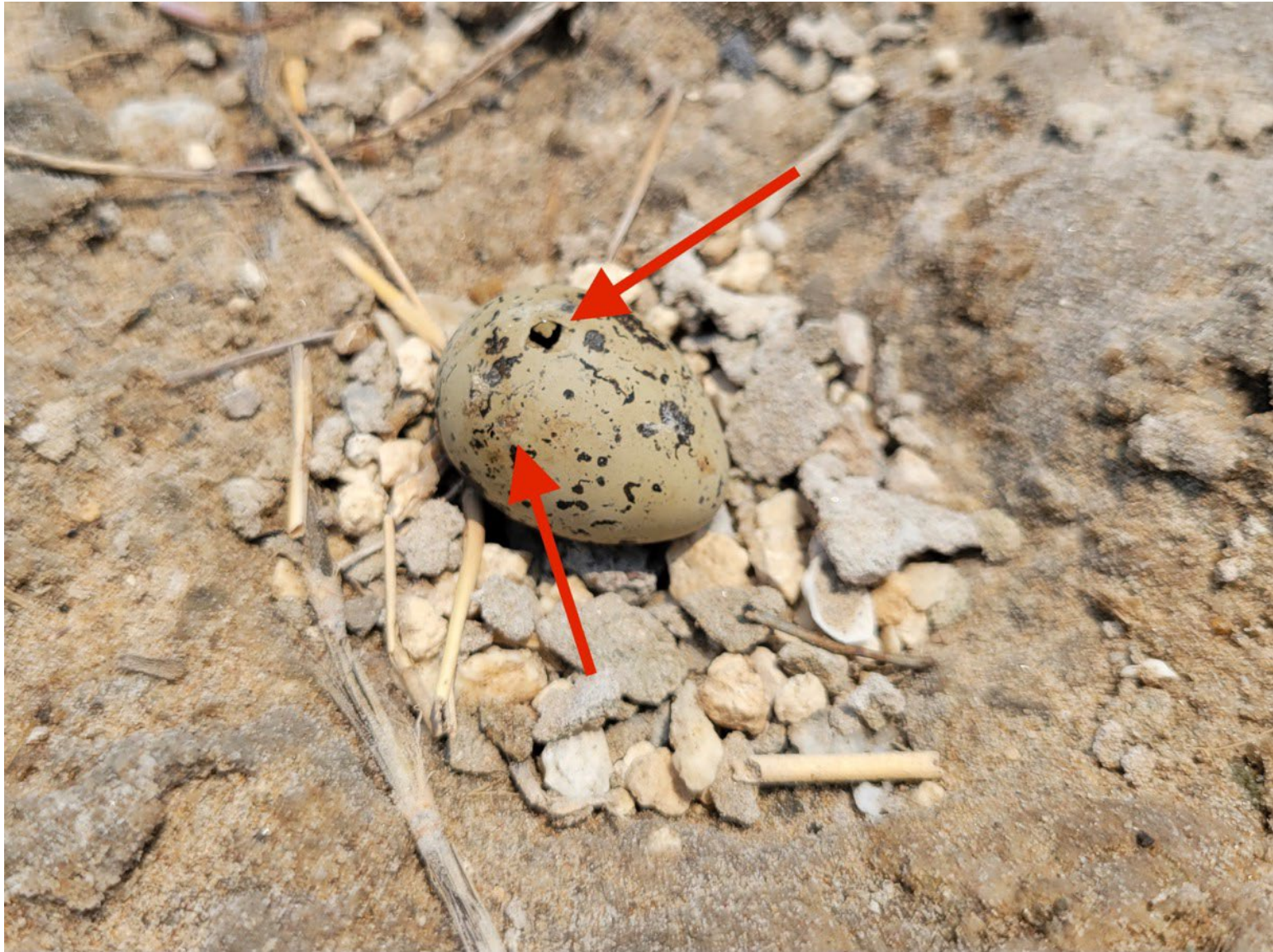
Figure 5. SNPL 2 close up photograph with arrows showing damage on single egg on June 6, 2024.