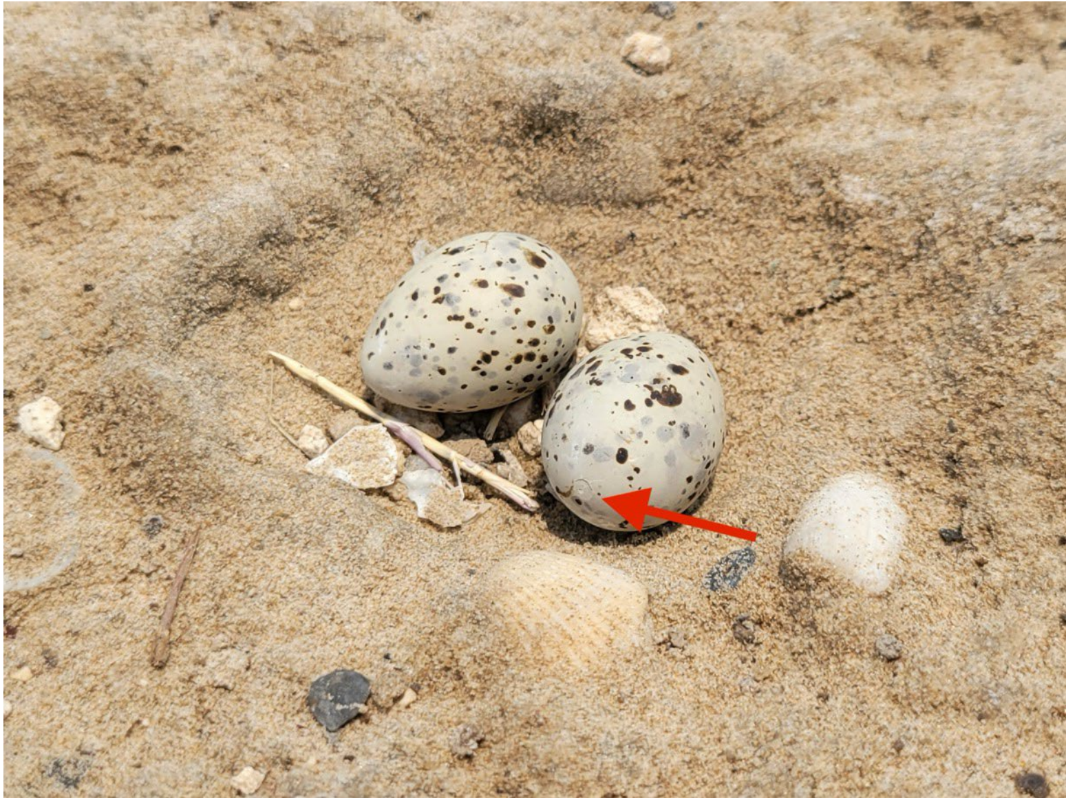
Figure 12. Small but noticeable depressed crack on egg from LETE 3 on June 6, 2024.