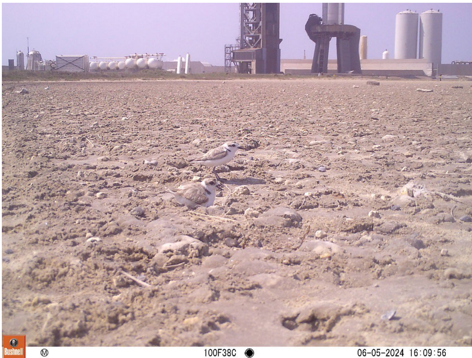
Figure 21. SNPL pair incubating SNPL 2 shortly after the game camera was set up pre-launch on June 5, 2024.